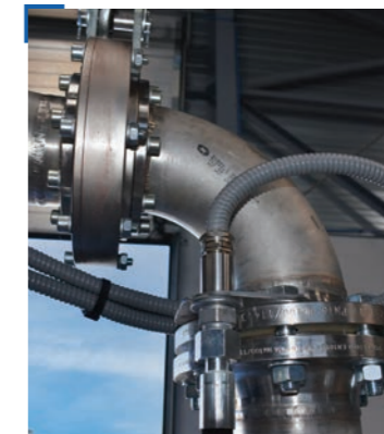
HEAVY-DUTY ROTARY UNION MOUNTED ON A LOADING ARM