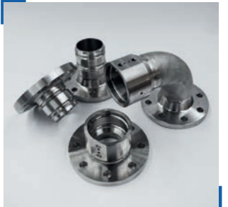
TP1100 R ROTARY UNION WITH AN ADJUSTABLE CONNECTION