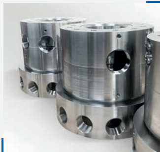
CUSTOM-MADE MULTI- PASSAGE ROTARY UNION, AGRI-FOOD INDUSTRY