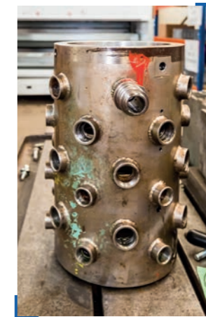
MULTI-PASSAGE ROTARY UNION RECEIVED FOR SPECIALIST ASSESSMENT