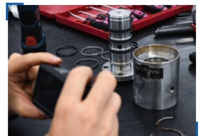
COMPREHENSIVE SPECIALIST ASSESSMENT BEFORE REPAIR

Agri-food, construction, chemicals, health, energy, environment, foundry, farms, petrochemicals, robotics, steel, transport, etc.