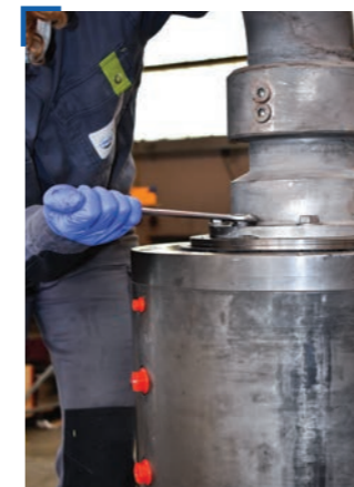
MAINTENANCE OF YOUR ROTARY UNIONS IN THE WORKSHOP