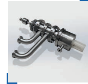
PROTOTYPE, FOOD INDUSTRY