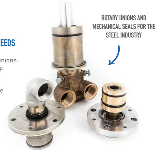
ROTARY UNIONS AND MECHANICAL SEALS FOR THE STEEL INDUSTRY