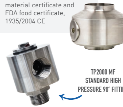
TP2000 MF STANDARD HIGH PRESSURE 90° FITTING

Delivered with the 3.1B material certificate and FDA food certificate, 1935/2004 CE